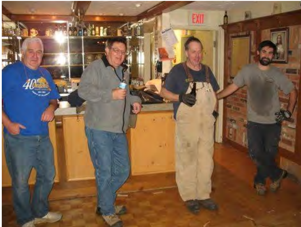
Part of our Awesome Team of Volunteers who Helped with the Floor Removal!